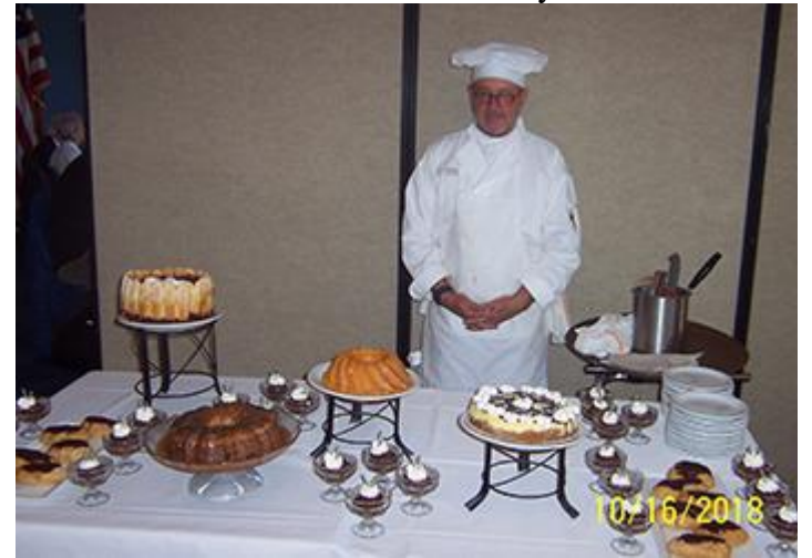
Tempting desserts prepared by Triton Hospitality Students.