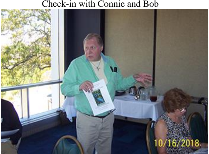
Topic: Allerton Park, an Illinois Treasure